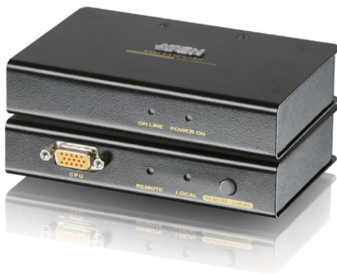
CE250AR (Remote unit)