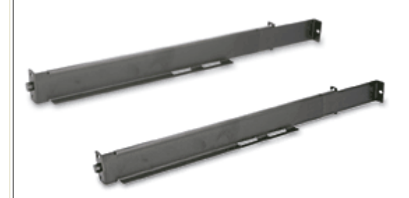
Optional rack mount kit Easy-Installation Rack Mount Kit - Short