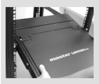
Step 2. Slide the KVM switch onto the rails and secure it to the rack.