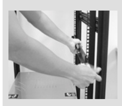
Step 1. Secure the side rails to the rack.

The following illustrations demonstrate just how easy it is to install your KVM switch with the Easy Installation Rack Mount Kit.