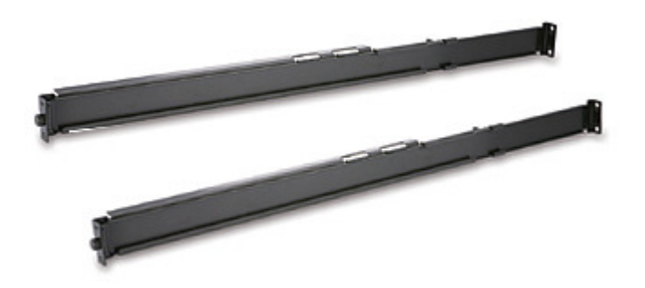
Optional rack mount kit Easy-Installation Rack Mount Kit - Long

Busy IT professionals will appreciate the convenience and simplicity that ATEN's Easy Installation Rack Mount Kit provides. This optional kit streamlines the rack mounting process, making it easy for a single person to accomplish. In a matter of minutes, your new KVM switch can go from the box to the rack – all without the hassle of having another person around to help you install it.